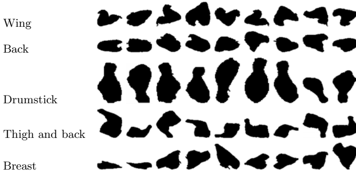
Fig. 1. Examples of Chicken data